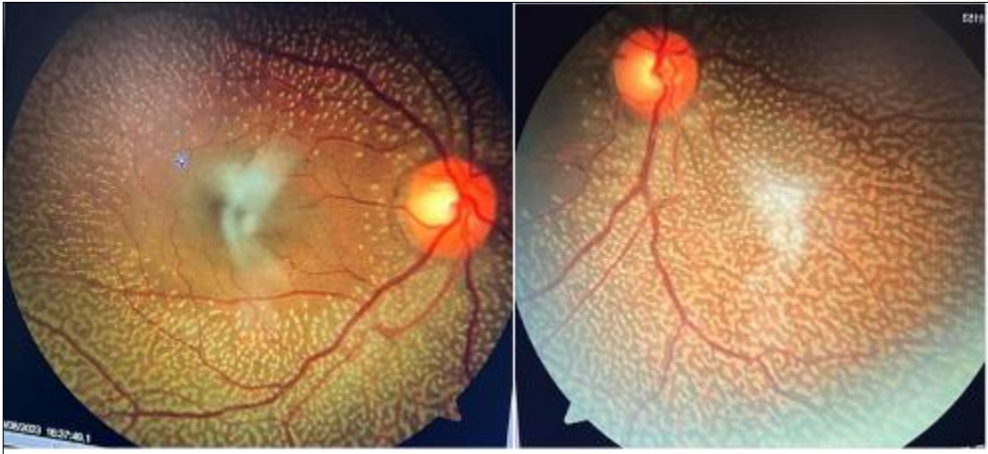
Figure 1 Fundus photographs showing multiple, small, yellow-white fleck like lesions with sparing of the fovea

None of his family members were affected. There was no history of consanguinity in the family.