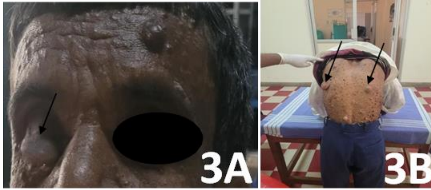
Figure 3A Neurofibroma of the upper eyelid with total ptosis of right eye, Figure 3B shows multiple neurofibromas over the back along with buttonhole sign which is also present suggestive of neurofibromatosis