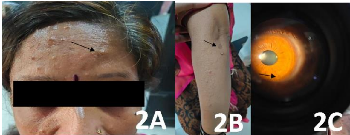
Figure 2A Multiple neurofibromas present over the forehead; Figure 2B Café au lait macules present over arm and hand, Figure 2C Lisch nodules present on iris

On ocular examination distant vision 6/12 both eyes. Colour vision was found to be normal. Slit lamp examination showed multiple domed elevated lesions on iris suggestive of Lisch nodules present on both eyes which is well known diagnostic criteria for the disease.