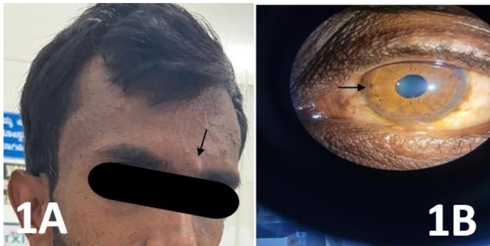
Figure 1A A single neurofibroma present over the glabella, figure 1B Slit lamp examination showed multiple domed elevated lesions on iris suggestive of Lisch nodules