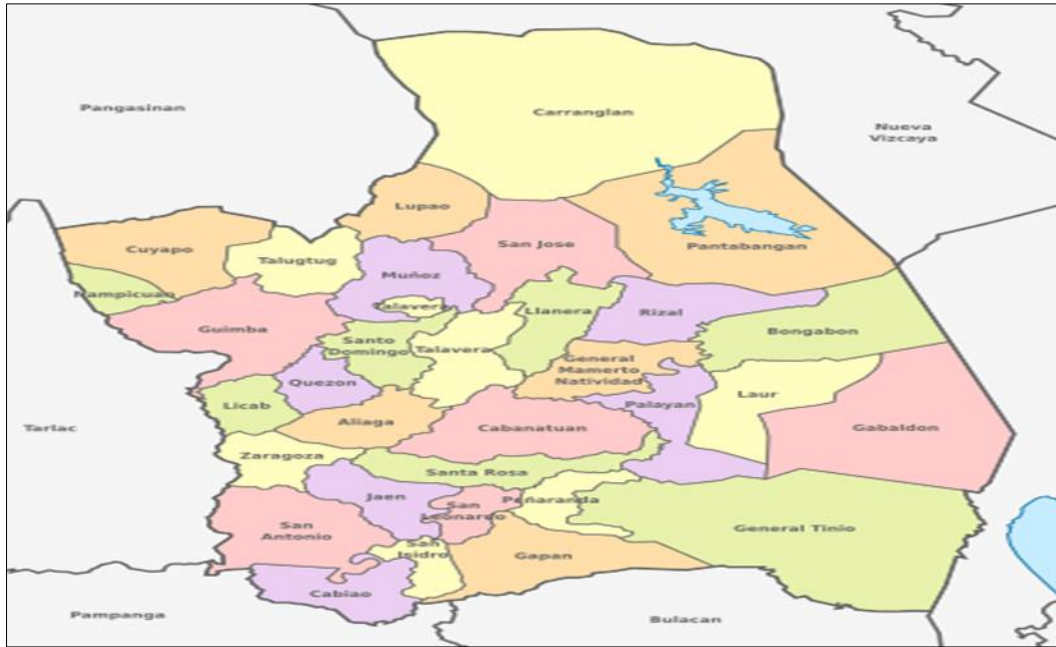
Figure 2 Nueva Ecija Map