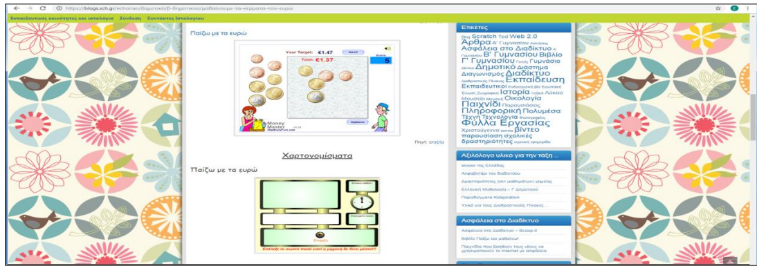
Figure 3 Calculating Euros

The students are asked to calculate the euros! (game- online)