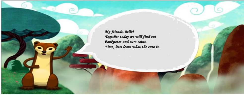
Figure 1 Introduction to Coins

-Students are asked to watch a video about coins (also shown on the interactive whiteboard)