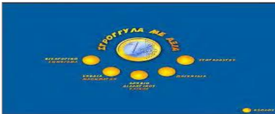
Figure 4 Familiarization with money learning activities

Students are asked to complete the task in the Rounds with Value Software (familiar money learning activities): We give money, we buy products.