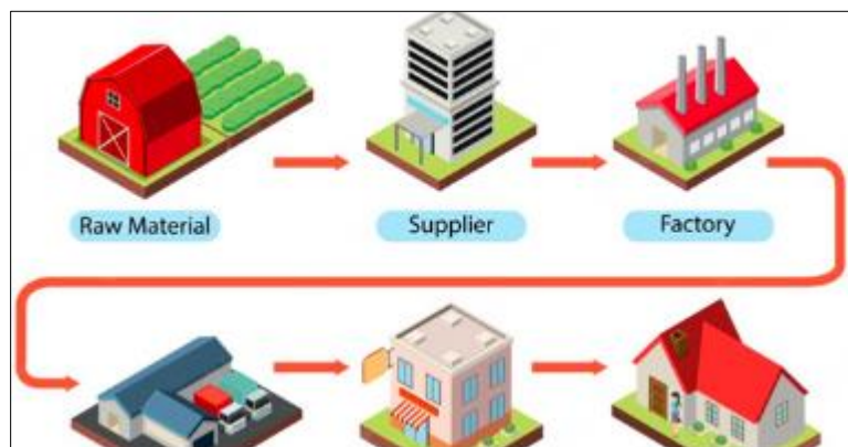
Figure 1 Supply Chain Management

A term "supply chain" describes a network of establishments that include the final consumers of the product as well as the makers, retailers, distributors, and carriers of the goods. Every one of these people is connected to a SC. In recent years, SCM has emerged as a critical differentiator for businesses. Optimising the entire value of the company via