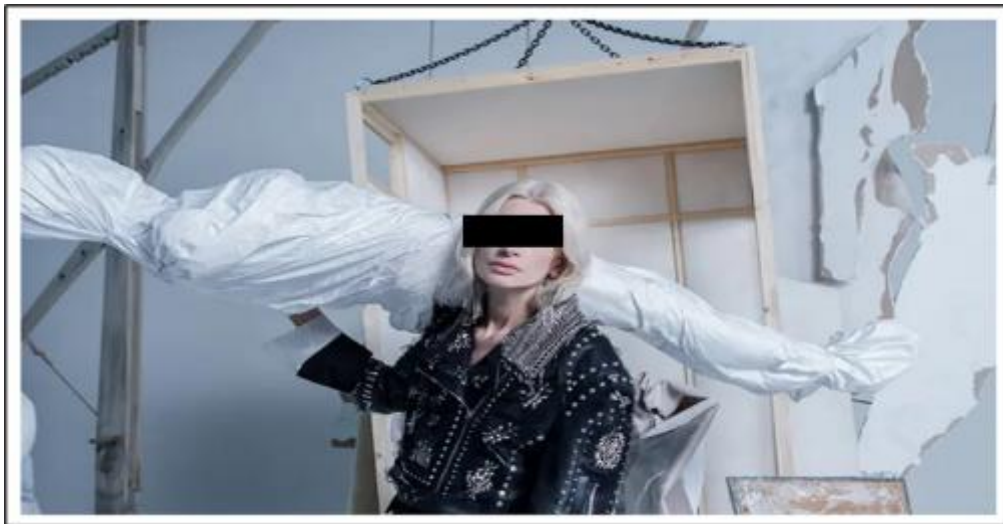
Figure 1 Critics of a recent Zara campaign said it recalled imagery from the Israel-Hamas war. The retailer removed the images, but said it had shot the campaign before the war began.

Below is a snippet of the Zara atelier ad campaign called “The Jacket.”