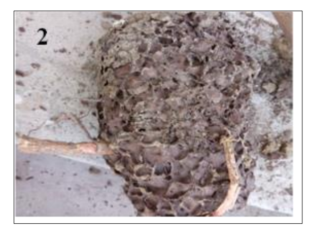
Figure 2 Termites in experiment collected from this wooden log