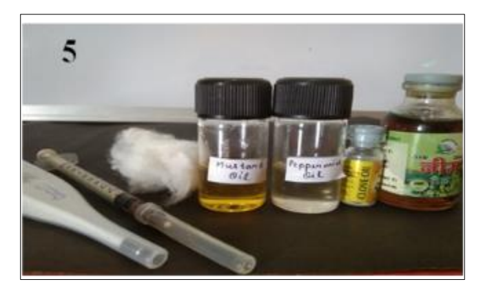
Figure 5 Instrument and Botanical oil used in the Experiment