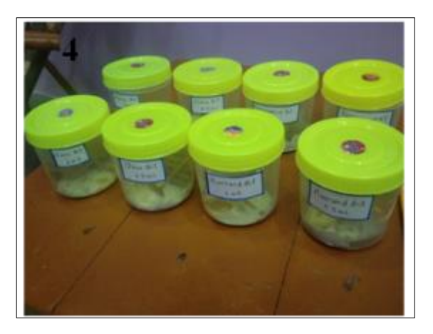
Figure 4 Experiment performed in boxes