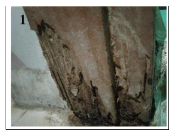
Figure 1 Damage caused by Termites to a part of wood furniture in domestic

The statistical analysis of data was done. Calculated the mean and standard error of data. (mean ±S.E.).