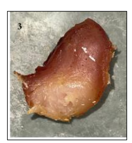
Figure 3 Blowfly eggs on a meat piece