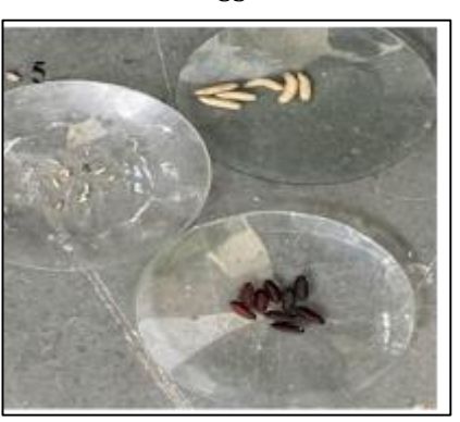
Figure 5 Instars and Pupa stages