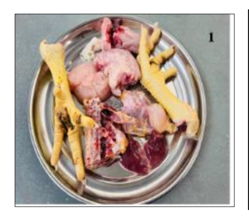
Figure 1 5-hour bed cut Broiler chickens.