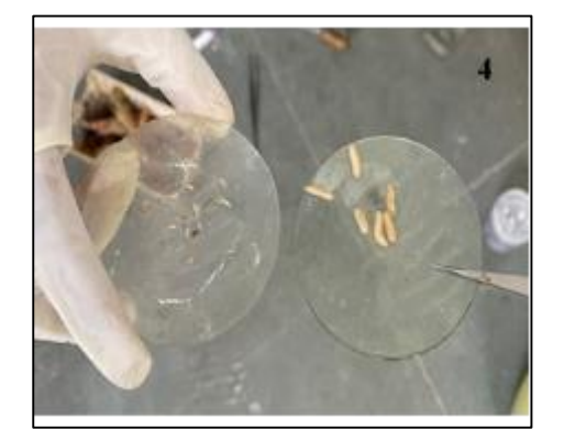
Figure 4 1 & 2 Instar stages of maggots