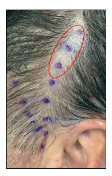
Figure 1 Mapping of PB (circled).

Using a handheld ultrasound doppler with lubricating gel, map out the STA. Begin just anterior to the tragus to identify STA, then follow the PB supero-posteriorly.