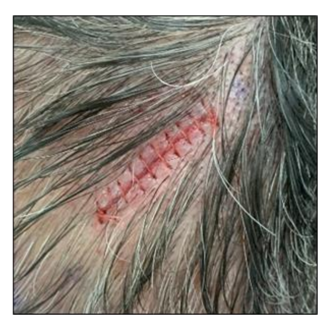
Figure 4 Closure of wound.

Ligate the segment of PB proximal and distally, ensuring a biopsy length of 2cm to account of pre-fixation shrinkage. Use tissue scissors to CUT both ends of PB (on the side of the artery to be removed) leaving a 2mm segment to prevent slipping of the hand tie. Use bipolar diathermy or dissection scissors to remove fascia from the artery. Place sample immediately in formalin solution.