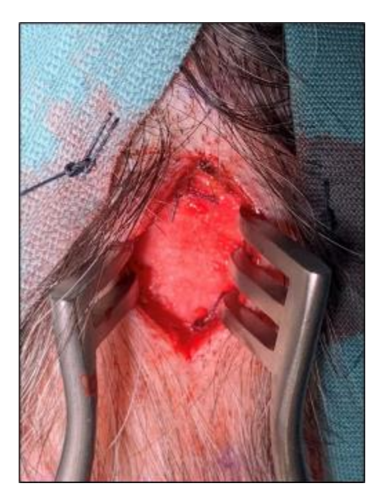
Figure 4 Ligation of STA.

Spread the skin and subcutaneous tissue with a mosquito forceps to reach the temporoparietal fascia, within which the STA runs. Place a self-retainer to retract the wound edges. Identify the PB and ligate larger branches with 3-0 vicryl hand ties and smaller branches with bipolar cauterisation. Suitable larger branches may also be harvested with the sample once ligated.