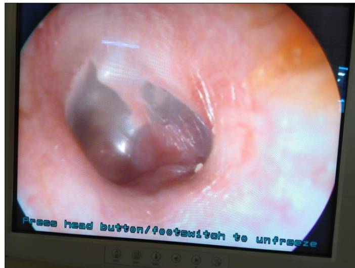
Figure 1 Ear endoscopic image shows a retrotympenic mass shown as a red shadow in the lower left part of the tympanic membrane

A 59-year-old male patient examined in the outpatient clinic of ENT Department in our hospital, because of a left lateral cervical swelling, difficulty in swallowing and pulsatile tinnitus in the left ear, for about one month. According to the patient's medical history, he did not receive any medication. medicine. Patient reported that the first symptom he manifested was pulsatile tinnitus, followed by the other symptoms. The clinical examination of the oropharynx showed an asymmetric swelling of the left tonsil. Through video laryngoscopy a left vocal cord paralysis was diagnosed. A retrotympenic mass shown as a red shadow in the lower left part of the tympanic membrane, was detected otoscopically (Figure 1).