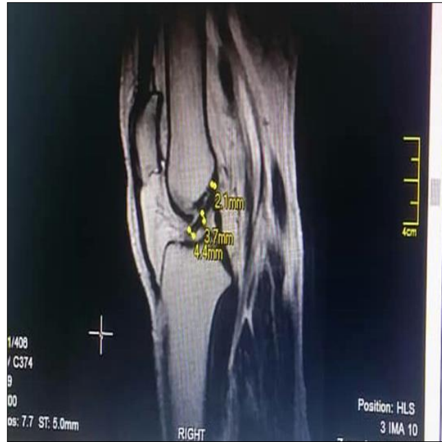
Figure 1 Measurement of ACL thickness on MR T2 saggital image