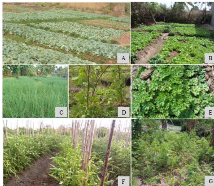
Figure 2 Some species inventoried in market garden sites in Daloa.

These are leafy vegetables, edible bulb vegetables, fruit vegetables, root vegetables and seed vegetables. Leafy vegetables were the most diversified with 5 cultivated species. These are cabbage, Brassica oleracea var. capitata L. (Brassicaceae), Round cabbage, Lactuca sativa L. (Asteraceae), Butter Lettuce , Lactuca sativa var. capitata L. (Asteraceae), Parsley, Petroselinum crispum (Mill.) Fuss (Apiaceae) and the Spinach, Spinacia oleracea L. (Chenopodiaceae). Seeds and roots vegetables are represented only by one species each of which are carrots, Daucus carota L. (Apiaceae) and green beans Phaseolus vulgaris L. (Fabaceae) respectively. Fig. 2 presents some species inventoried in the market gardens in the city of Daloa.