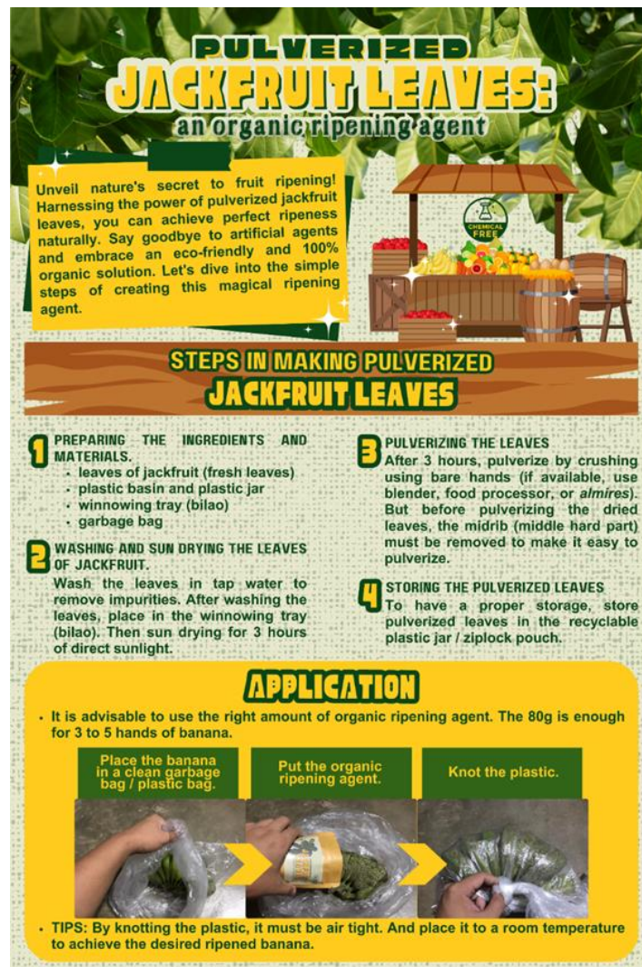
Figure 4 Infographics of best organic ripening agent

The findings emphasize the notable dissimilarity in the efficacy of pulverized Madre de Cacao leaves, pulverized Jackfruit leaves, and the combination of both in facilitating Saba banana ripening across the various sets. Pulverized jackfruit leaves exhibited efficacy in expediting the ripening process, demonstrating slight effectiveness in achieving a yellow color, enhancing palatability, and leading to soft and creamy ripened bananas (Farouq and Chritianah, 2022) [7]. In contrast, pulverized Madre de Cacao leaves displayed moderate effectiveness in sets 1 and 2 concerning duration, while showing slight effectiveness in enhancing mild sweetness but no effect in reducing starchiness in set 3 (Aba et al., 2018) [8]. The achievement of a yellow color was moderately observed with Madre de Cacao leaves. The combination of Madre de Cacao and jackfruit leaves did not effectively enhance odor compared to naturally ripened bananas. In terms of duration, a slightly effective result was observed, with bananas ripening on day 4 (Ruwali et al., 2022) [9]. Furthermore, the combination was found to be not effective in minimizing the starchy taste but slightly effective in enhancing the mild sweet taste of Saba bananas. In terms of texture, the effectiveness varied between not effective and slightly effective. These findings underscore the substantial impact of different ripening agents across various sets.